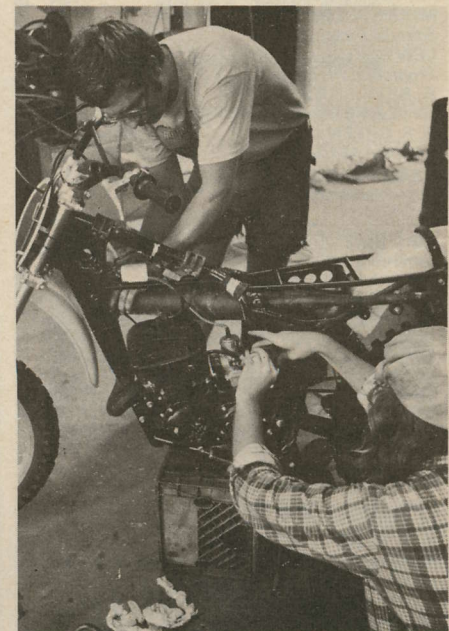
Divining the truth? p. 68