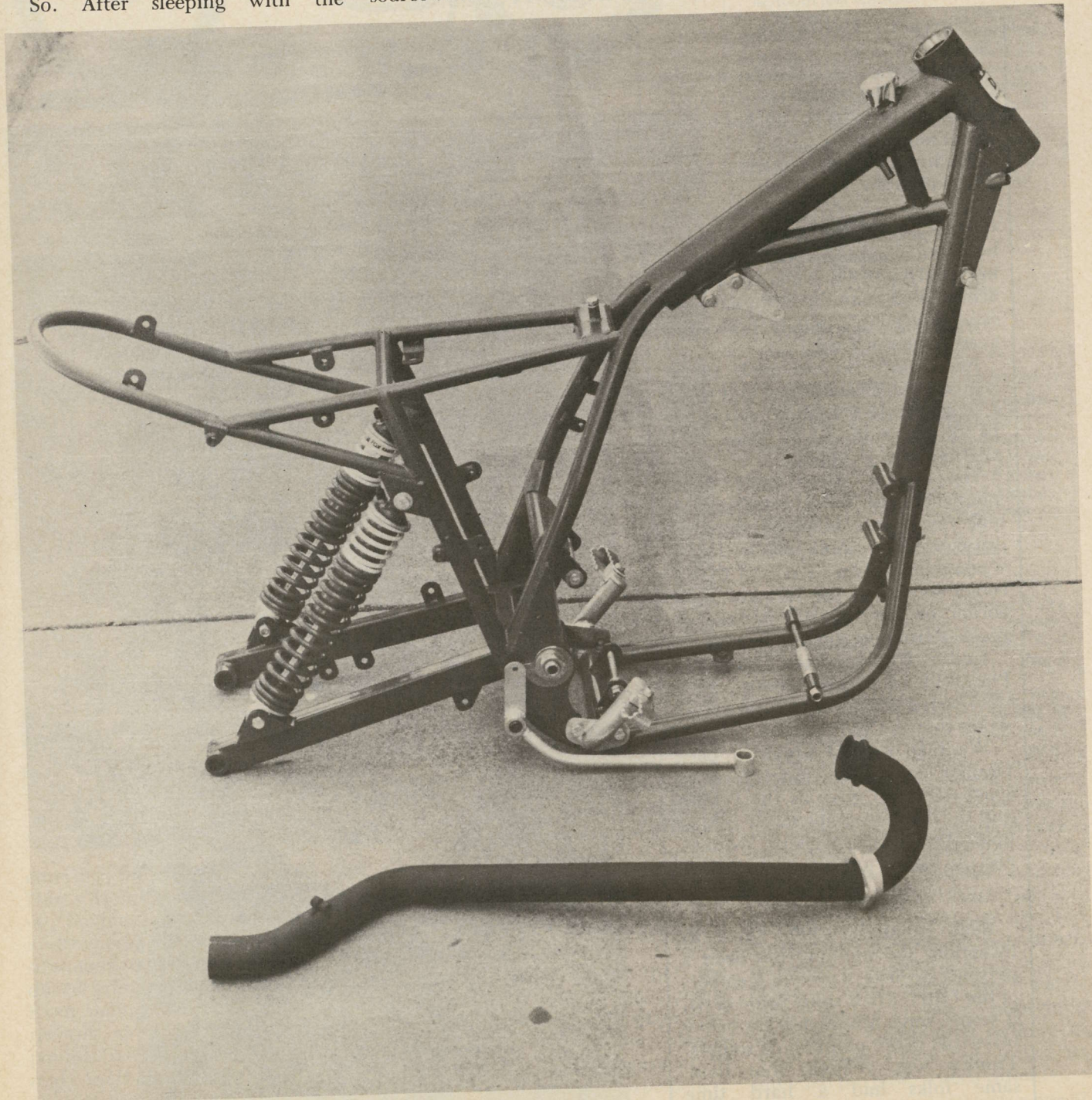
A fine piece of workmanship. Would that we could show it to you in color . . .