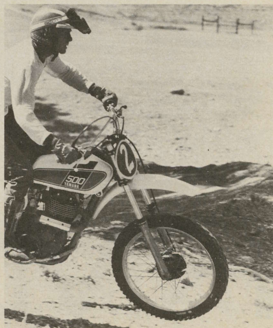
. . . and out.