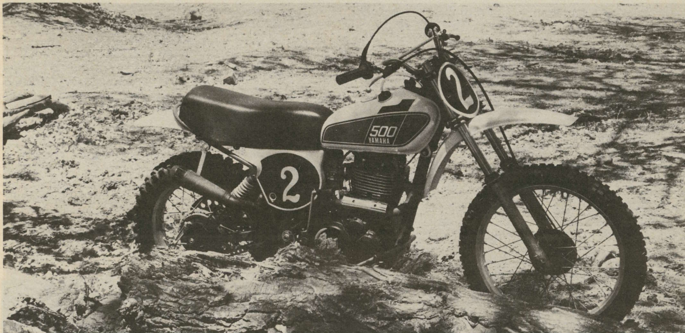
The completed package doesn't look that different from stock. Super-Trapp silencer reaches a fine compromise between power and quiet.